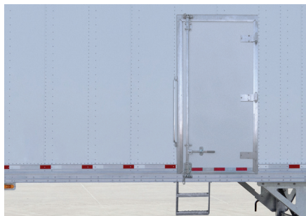
High strength side wall provides various options for different needs.