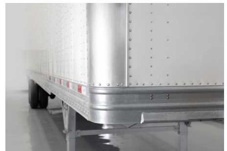
Structural components feature hot-dipped galvanization for corrosion resistance.