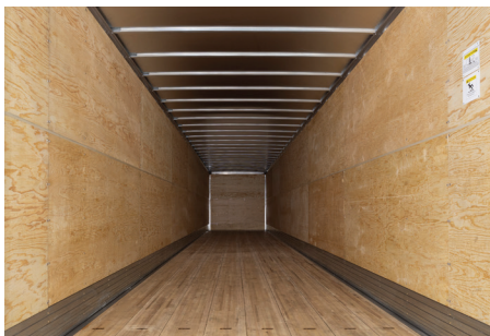
Standard wood lining with exterior grade plywood.